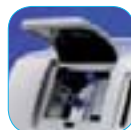
Roller 10 PN 1 rotor for 10 samples

Power supply: 115-230 VAC, 50/60 Hz Power consumption: 100VA Operative temperature: from +10 to +30°C Size: 240x380x450 mm Weight: 14/16 Kg In/ out specifications: two RS232 serial ports Optional accessories: external CCD bar code reader