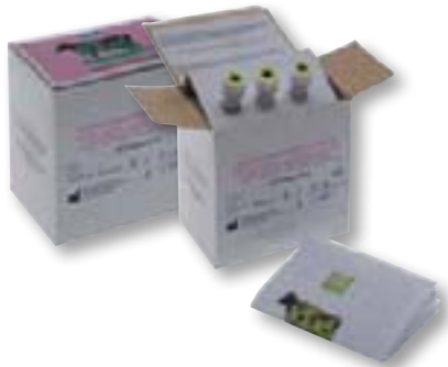
Latex Control Kit 6 tests Code SI 305.100-A (Greiner tubes), SI 305.102-A (Sarstedt tubes)