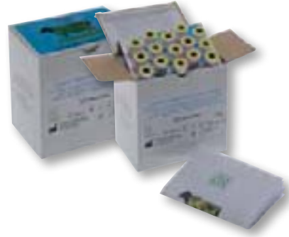
Latex Control Kit 30 tests Code SI 305.300-A (Greiner tubes), SI 305.302-A (Sarstedt tubes)