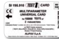
Code SI R20-LC