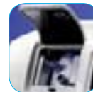
Roller 20 PN 2 rotors for 20 samples and automatic washing system