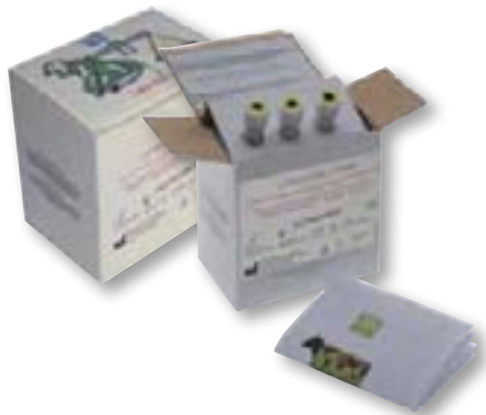
External Quality Evaluation Kit Specific for Test 1 family instruments Code SI 305.500-A (Greiner tubes), SI 305.502-A (Sarstedt tubes)

SHELF LIFE: From production: 6 months. From the 1 st piercing: 6 weeks STORAGE CONDITIONS: refrigerated temperature (+2+8°C)